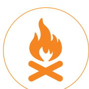
Outdoor fire near urban areas