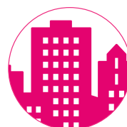
Changing built environment