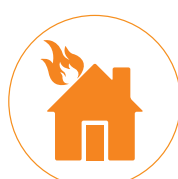
Fires in the home