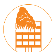
Fires in large public and commercial buildings