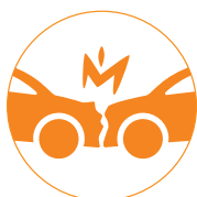
Road traffic collisions