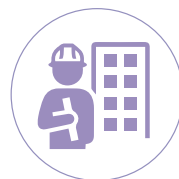
Building configuration and construction