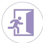
Building ownership and management