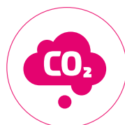
Sustainability and climate change