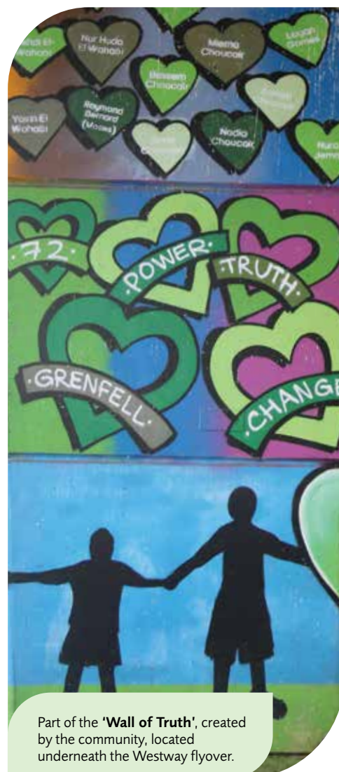
Part of the 'Wall of Truth', created by the community, located underneath the Westway flyover.