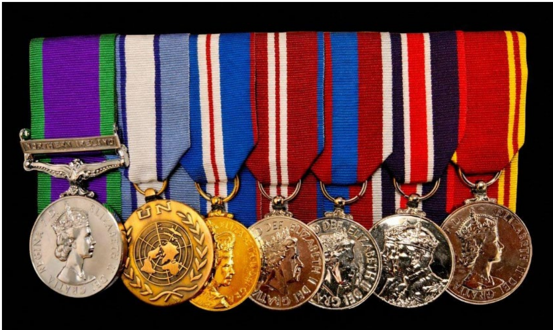
An example of full-sized Court mounted medals.

This method dates back to the courtiers during Queen Victoria's reign. Queen Victoria didn't like the clinking of medals rubbing together so this method was derived to prevent this.