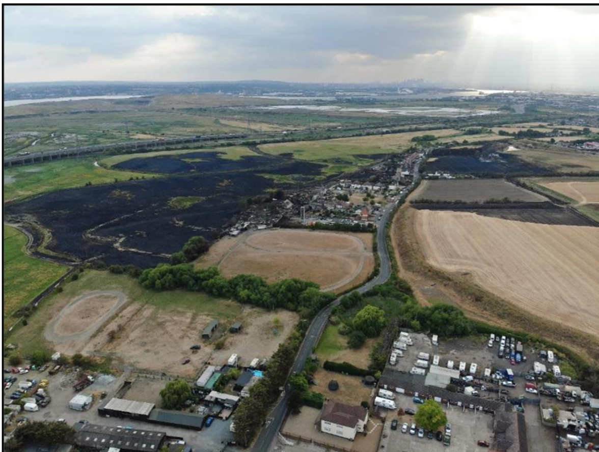
Aerial view of fire damage (looking east to west)

The properties within the village were a mix of detached, semi-detached, and terraced houses, all of traditional construction.