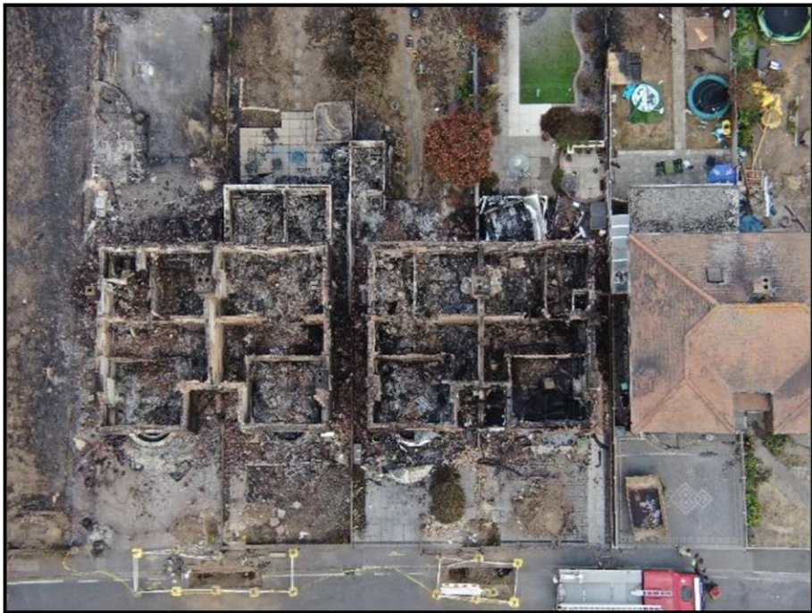
Image 8 No's.17, 18 & 19, 20 Kent View