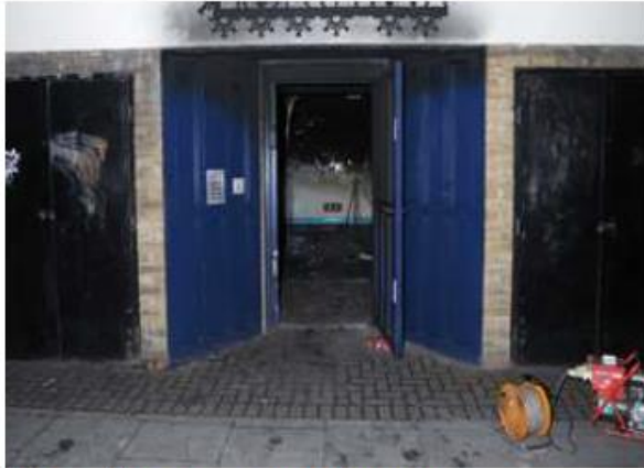
View of front communal entrance

4.27 The following example involved a small motor scooter in a communal area. What is notable is the extensive damage not only from smoke, but also from the heat. There was apparently relatively little petrol in the scooter; the majority of the fuel loading was from the plastic body panelling.