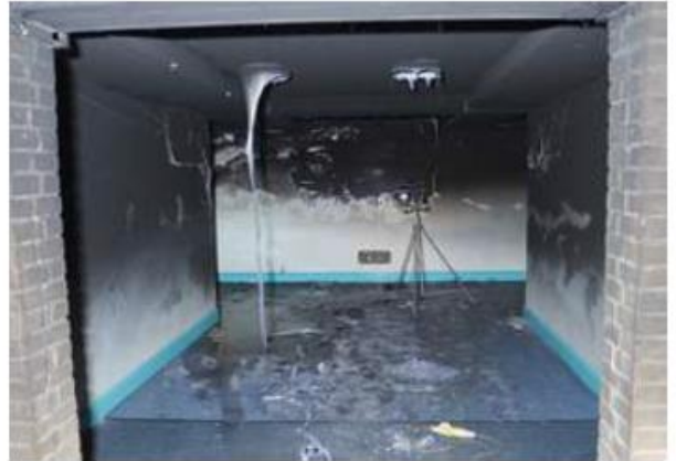
View going in through the communal entrance. Note light fittings have melted