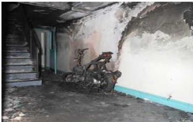
Clear burn pattern behind the scooter, Note rear tyre is still intact