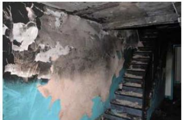
Stairwell opposite the scooter. Note; spalled plaster from the stairwell has fallen onto the stairs