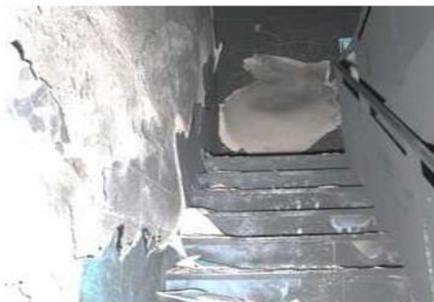
Image to left: View upstairs showing extensive heat and smoke damage.